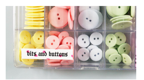
Decorative Pattern Tape Range Add a personal touch with the durable and unique pattern tapes. With four options to choose from, your gifts will stand out from the rest.

Ribbon Tape Range Select from four choices of premium quality, beautiful satin ribbons. The gold characters on the ribbons are printed using thermal (heat transfer) technology meaning they do not fade or fall off, and can be integrated into clothing.