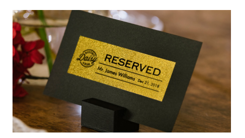
Premium Tape Range Add some shine to your organisation with three new premium tapes providing a glittery alternative.

With a great range of different tapes to choose from the possiblities are endless. Create stylish ribbon, decorative and laminated durable tapes that will add extra flair to your home or office.